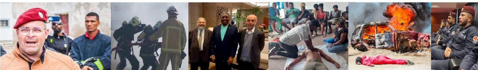
(c) 2019 - 2023 - Templar Corps International secretary@templarcorps.org